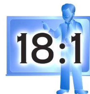
STUDENT : FACULTY