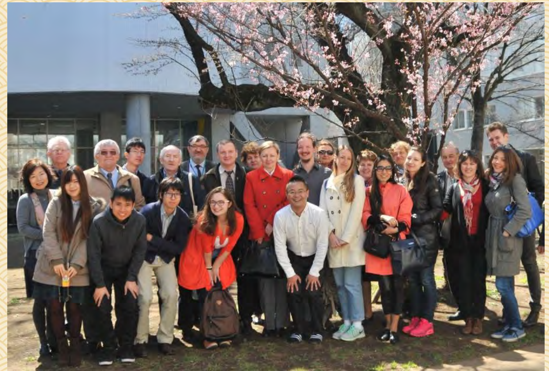
Visit of a group of young scientists from MSU to the University of Tokyo