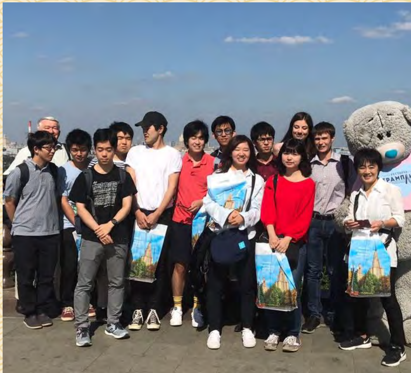
Visit of a group of young scientists from the University of Tokyo to Moscow

Exchange of young scientists and joint research schools