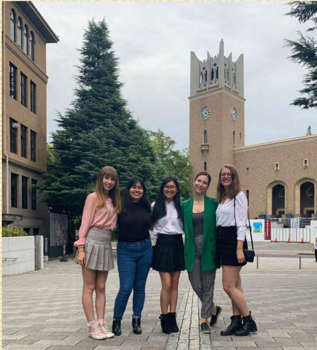
MSU student in Waseda University

Semester academic exchange programs for students, STEPS programme