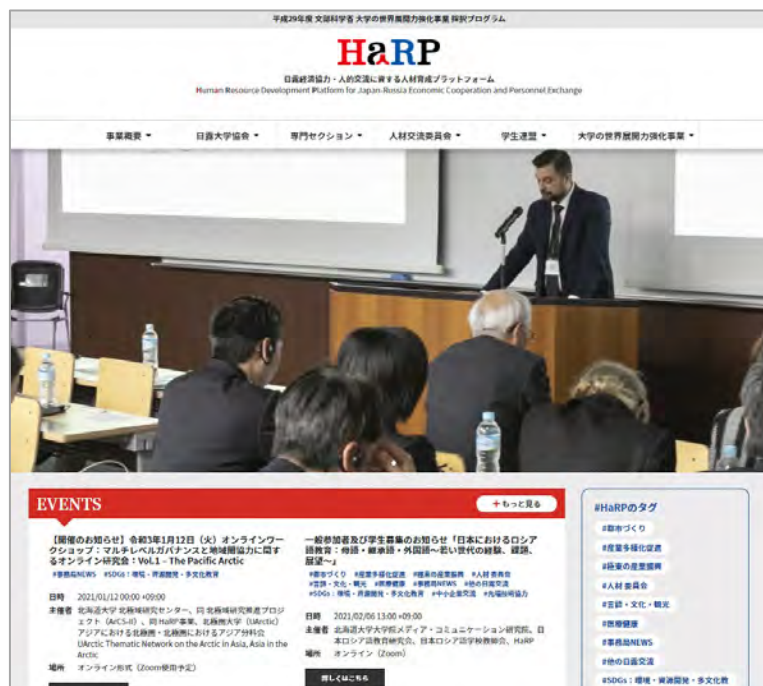
↑ HaRP Project Website