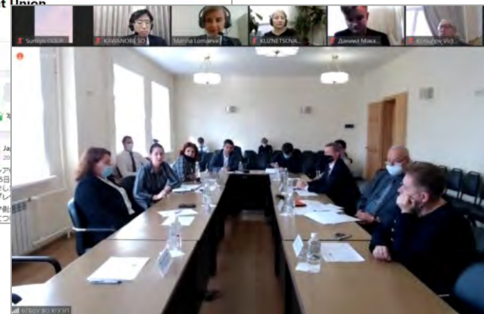
Online Meeting in Oct 2020 →