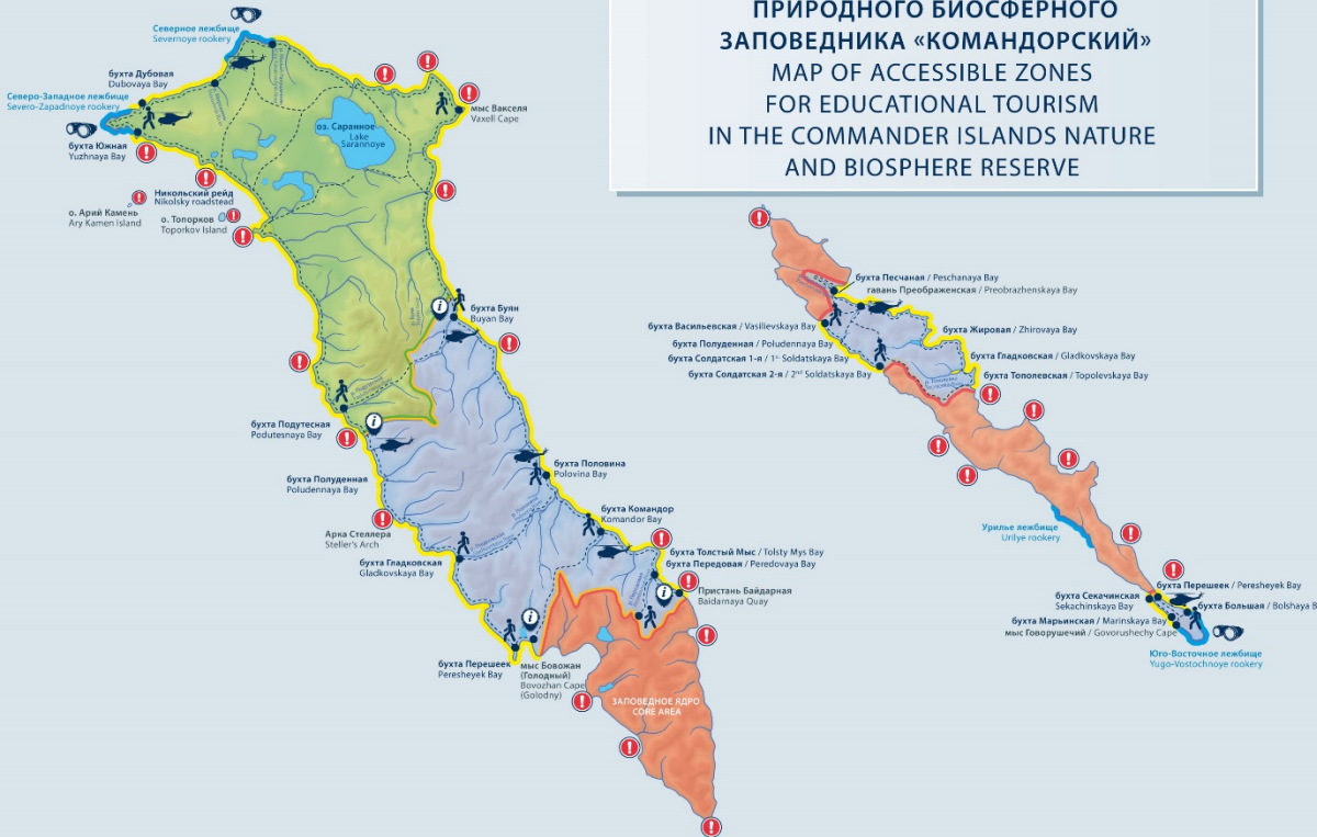
СХЕМА РАЗРЕШЕННЫХ ДЛЯ ПОСЕЩЕНИЯ, С ЦЕЛЬЮ ПОЗНАВАТЕЛЬНОГО ТУРИЗМА, УЧАСТКОВ ГОСУДАРСТВЕННОГО ПРИРОДНОГО БИОСФЕРНОГО ЗАПОВЕДНИКА «КОМАНДОРСКИЙ» MAP OF ACCESSIBLE ZONES FOR EDUCATIONAL TOURISM IN THE COMMANDER ISLANDS NATURE AND BIOSPHERE RESERVE

General Rules: You will need permissions from Russian Federal Security Service and Border Guard