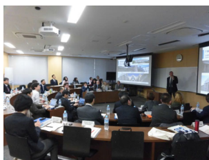
The 4th Committee for Personnel Exchanges (2020.1.30)